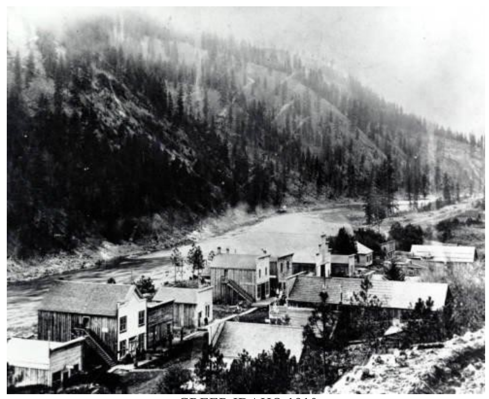
GREER IDAHO 1910

LEWIS & CLARK 1806 RETURN TRAIL FROM LENORE, IDAHO TO THE CONFLUENCE OF ELDORADO CREEK WITH LOLO CREEK.