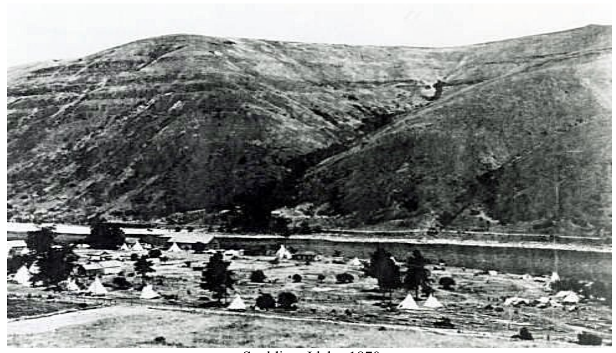
Spalding, Idaho-1870