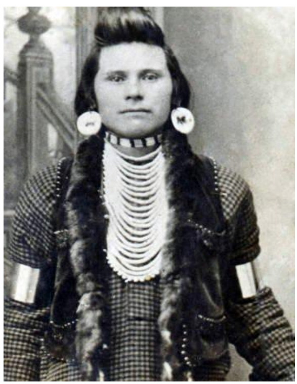
Portrait of a young Native American Circa 1886 Courtesy of the University of Idaho Library, Special Collections & Archives PG-100-322.