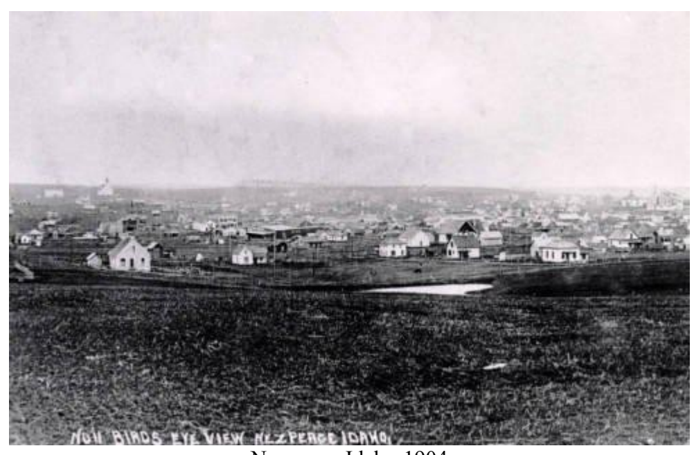
Nezperce, Idaho-1904  PG-5-101-1a.