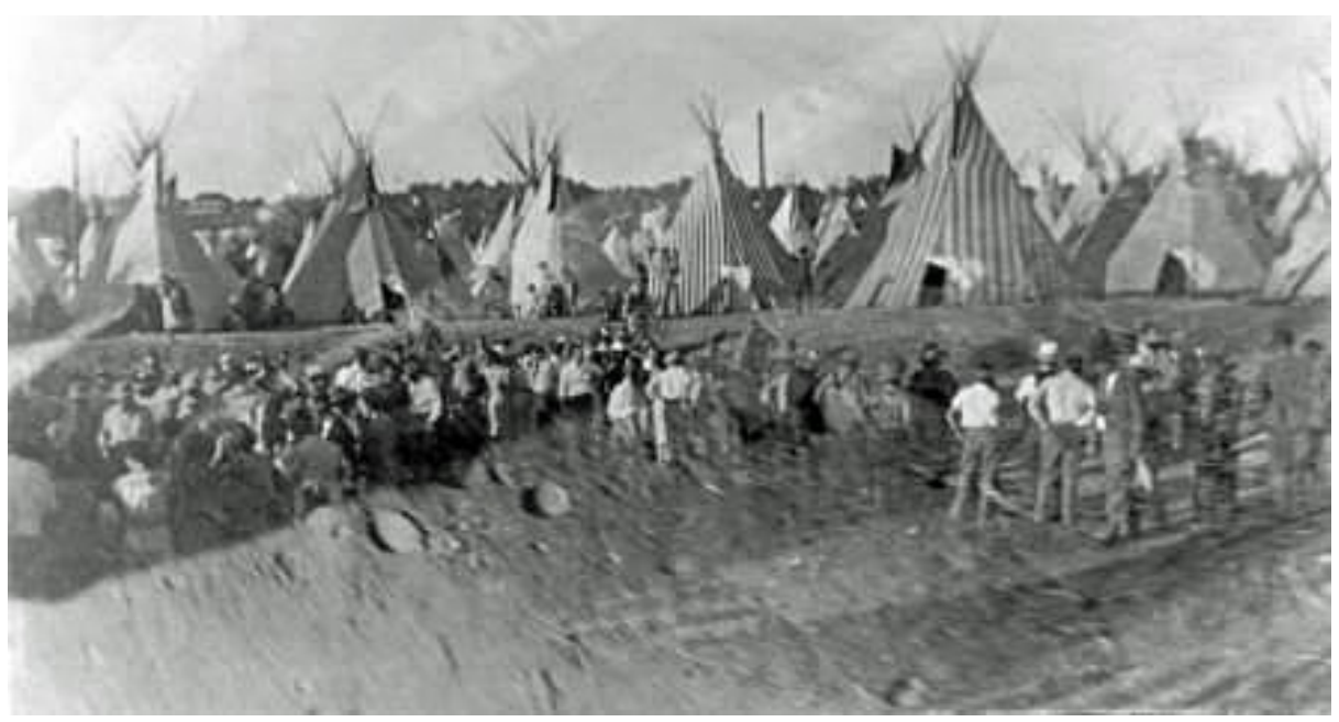
Tipi Complex-1905 Courtesy of University Of Idaho Library, Special Collections & Archives, PG-100-163.

NAD 27: 46* 29' 59.78"N 116* 19' 30.29"W NAD 83: 46* 29' 59.42600"N 116* 19' 33.79907"W UTM Zone 11: Easting 551713.1 Northing 5149806.3