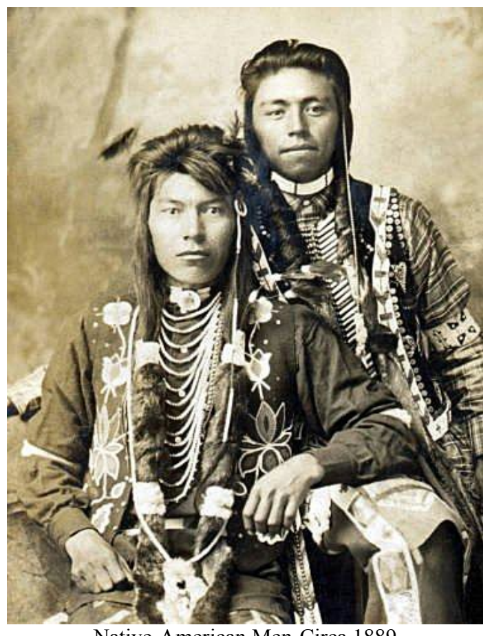
Native-American Men-Circa 1889

North Between Sections 11 & 12 @ 2100 ft. Lewis & Clark, May 13, 1806.