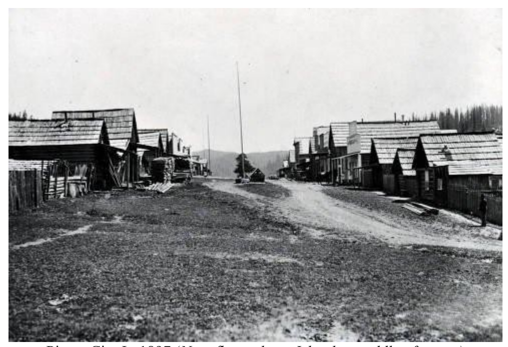
Pierce City In 1897 ( Note flag pole on Island in middle of street. )

NAD 27: 46* 27' 20.25"N 115* 50' 56.31"W NAD 83: 46* 27' 19.91684"N 115* 50' 59.81099"W UTM Zone 11: Easting 588317.3 Northing 5145304.8