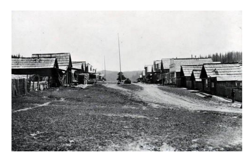
Pierce, Idaho-1893 Courtesy of the University Of Idaho Library, Special Collections & Archives PG-5-085-2b.

1896: M.B. Morrow laid out the town of Morrow on the south side of the stage road from Lewiston. The stage road followed the old trail from Lewiston into Idaho County.<sup>26</sup>