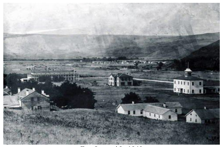
Fort Lapwai In 1940 Courtesy of University Of Idaho Library Special Collections & Archives PG-5-013-4a

NAD 27: 46* 22' 10.41"N 116* 35' 06.95"W NAD 83: 46* 22' 10.01336"N 116* 35' 10.47831"W UTM Zone 11: Easting 531824.2 Northing 5135180.9